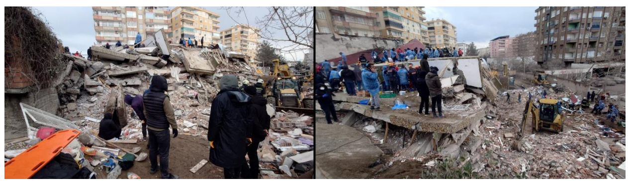
Figure 1. Scenes of damage from the February 6, 2023 earthquake in Turkey.