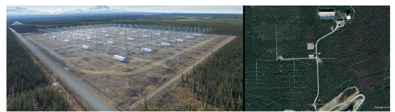
Figure 2. Left: High Frequency Active Auroral Research Program (HAARP) facility in Gakona, Alaska (USA). Right: Norwegian Tromsø ionosphere heating facility.

Figure 2 (left) shows the HAARP ionospheric heater in Gakona, Alaska (USA). Its 180 units are capable of producing a total radiated power level of 3.6 MW with an effected radiated power of approximately 575 MW [36, 41]. Figure 2 (right) shows one of the other ionosphere heaters, this one in Tromsø, Norway, with an effective radiated power of 300 MW [29, 31, 42] which, like HAARP, is capable of triggering earthquakes [38-40].