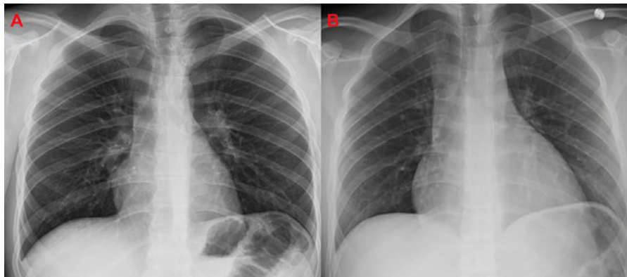
Figure 2. Chest radiographs on (A) initial presentation (within normal limits), and (B) on return visit 2 weeks later now demonstrating enlarged cardiac silhouette, consistent with large pericardial effusion.

carditis. Chest x-ray study, formal echocardiogram, and troponins were all within normal limits. After discussion with the Cardiology service, he was discharged on a regimen of ibuprofen 800 mg every 8 h, with a plan to follow-up with Cardiology as an outpatient. Three days later, his chest pain was persistent, and he was started on additional colchicine 0.6 mg daily.